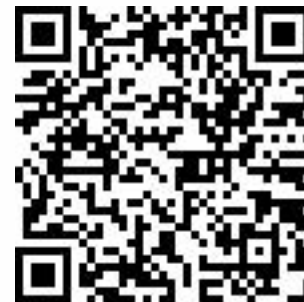
Registration QR Code